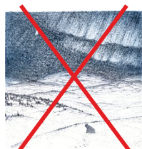
"Luosto's spell" Väinö Rouvinen