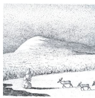
"Crusted snow" Väinö Rouvinen