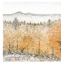
"Wolves embraced by autumn colors", Väinö Rouvinen